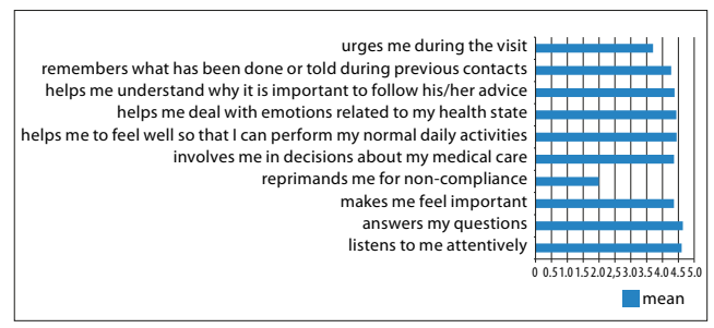
Figure 1. Mean ratings of particular aspects of doctor's behavior towards the patients

The psychiatric care was evaluated by patients as follows: mean=48.45; SD=0.66. Communication competence of the doctor had higher ratings (answers my questions mean=4.64; SD=0.58 and listens to me carefully, mean=4.60; SD=0.61). Mean ratings of particular aspects of doctors' behaviour towards the patients are presented in Figure 1.